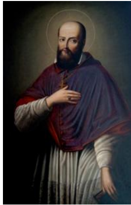
St. Francis de Sales

Through the high school program at Mary, Mother of God School , students are formed as young Catholic men and women in an intensive, individualized academic program combined with an active spiritual life and ongoing community service.