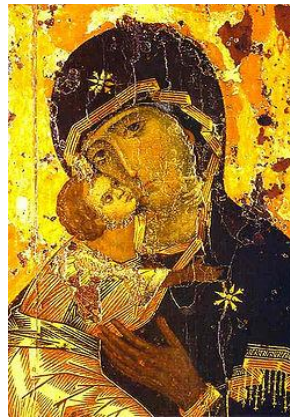
Mary, Mother of God

Students learn to recognize themselves and one another in their love for Christ, the centre of the school's life and mission, and to express their love for God and neighbour in concrete forms of service.